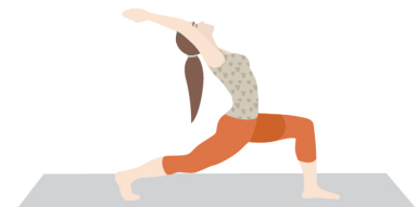
Crescent Pose Anjaneyasana