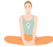
Bound Angle Pose Baddha Konasana