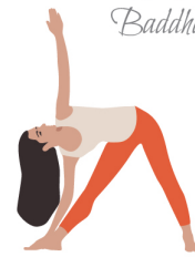
Triangle Pose Utthita Trikonasana